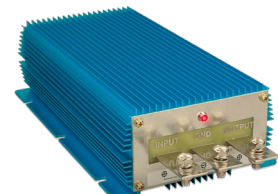
Orion IP67 24/12-100 Orion IP67 12/24-50